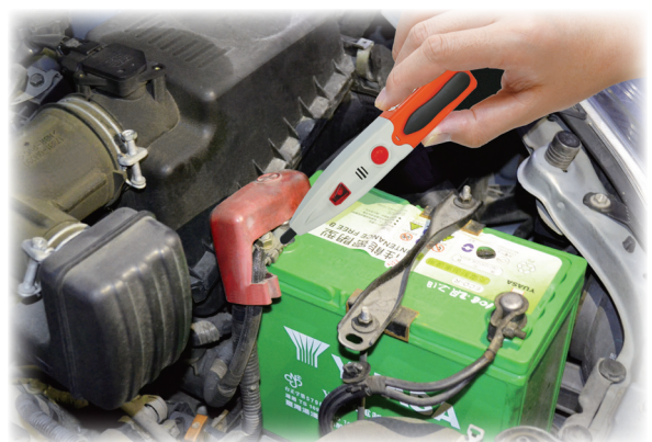
• DC voltage detection