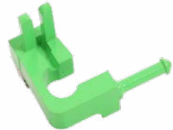
*add "F" for Hi Visibility

The Grab-It™ is machined from aircraft grade aluminum to provide years of trouble free operation. The Grab-It™ has no moving parts, no springs and no plastic parts to break.